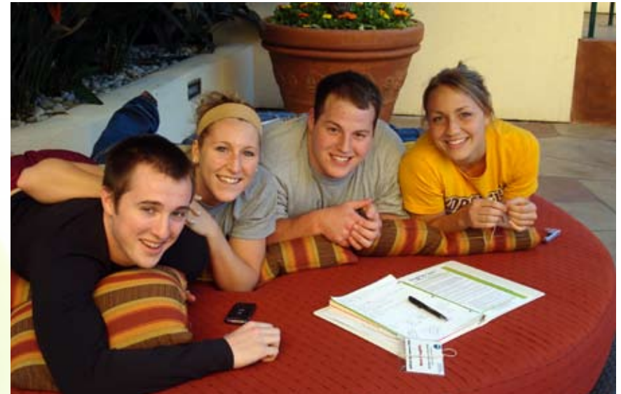
2009 Northern State University APPLE Team