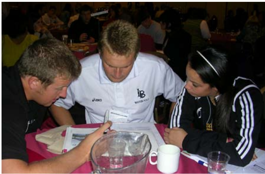
2009 Cal State Long Beach APPLE Team

“The 2009 APPLE Conference along with the follow up meeting has had an impact on me in such a way that has gotten me more involved with not only the administrators but the student-athletes on my campus as well.”