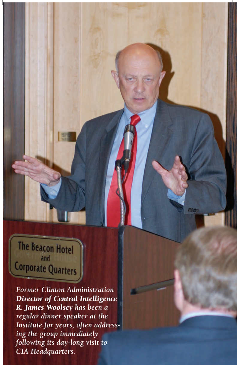
Former Clinton Administration Director of Central Intelligence R. James Woolsey has been a regular dinner speaker at the Institute for years, often addressing the group immediately following its day-long visit to CIA Headquarters.

Each year, the group travels to Washington, DC, for three or four days during the first week to spend a day at CIA Headquarters and to meet with other senior national security lawyers from the White House, the Department of State, the Pentagon, and with former