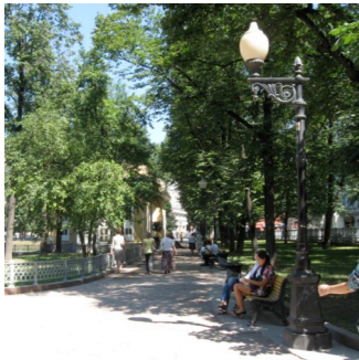
Patriarchs' Ponds, Moscow

The first two weeks of this course will be taught in Moscow. There we will read and explore the works of Tolstoy, Chekhov, Mayakovsky, Bulgakov, Erofeev, Vysotsky, and others. We will visit museums, theaters, and other places associated with these writers and we will become acquainted with the city that shaped their lives. In the second two weeks of the course, we will be in St. Petersburg. There we will focus on the literary works of Pushkin, Dostoevsky, Gogol, Akhmatova, and others.