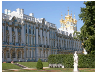
Summer Palace/Catherine's Palace

Founded by Peter the Great in 1703, St. Petersburg has been called "the Venice of the north." St. Petersburg is built on a series of islands at the head of the Gulf of Finland on the Baltic Sea. There are hundreds of bridges – many of them works of art – spanning the rivers and canals of the city. For over two centuries the capital of the Russian Empire, St. Petersburg is a major European cultural center. The city's architectural monuments, museums, theaters, and parks attract many visitors, especially during the "White Nights" of early summer.