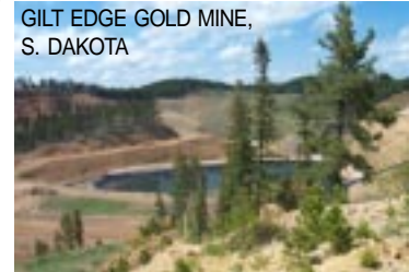
GILT EDGE GOLD MINE, S. DAKOTA