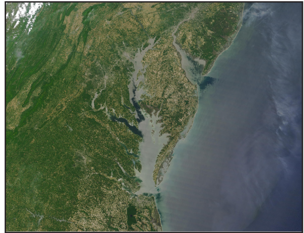
The Chesapeake Bay from Space

The Chesapeake Bay restoration and conservation effort is arguably one of the most comprehensive environmental