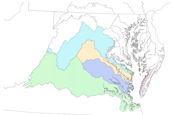
The graphic above shows the five major Chesapeake Bay basins in Virginia.

That will mean the region must now do what it had long sought to avoid: develop cleanup plans, known as Total Maximum Daily Loads (TMDL), for those waterways. Key parts of a TMDL include the establishment of the maximum amount of pollution that a body of water may receive and still meet its standards, with a margin of error. That “load” is then “allocated” to sources contributing to the problem, essentially setting a pollution limit for each source. When that source has a permit, the allocation is typically required to be part of the permit.