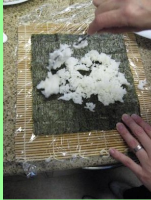
Spread cooked rice evenly