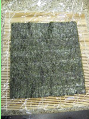
Place roasted seaweed on wrap