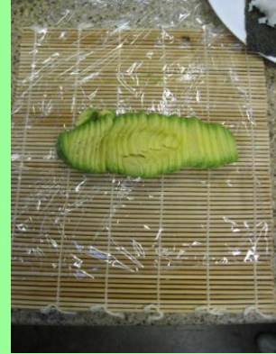
Thinly slice avocado and spread