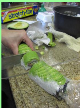
Slice into bite sized pieces