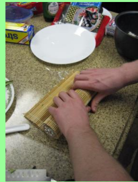
Roll everything together tightly