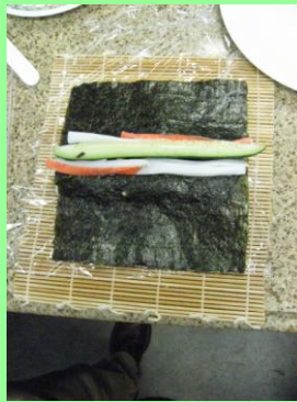
Add the crab and cucumber