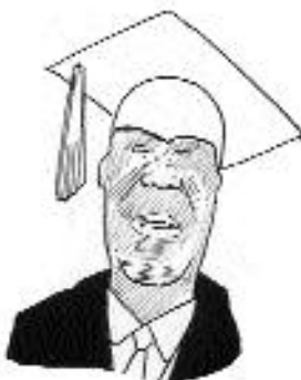
Nationwide, the Black Student College Graduation Rate Is a Very Low 42 Percent. But Black Women Are Far More Likely Than Black Men to Complete College.

Graduation rates play an important role in measuring the success of affirmative action programs. Many opponents of affirmative action assert, often without even looking at the actual data, that black student graduation rates are damaged by race-sensitive admissions. It is critical to review the statistics to see if this is true. In this report we emphasize the graduation rates of black students at the nation's highest-ranked colleges and universities. The reason is that almost always these are the institutions that have the strongest commitments to race-sensitive admissions.