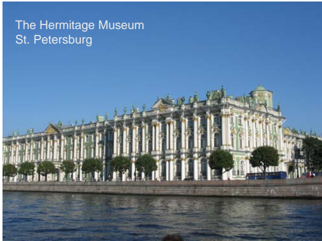
The Hermitage Museum St. Petersburg