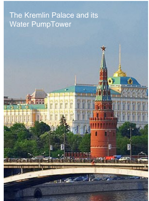
The Kremlin Palace and its Water Pump Tower

visit its exquisite private theatre, where renowned artists such as Pavlova and Shaliapin have performed. In the evening, enjoy a private canal boat ride through St. Petersburg.